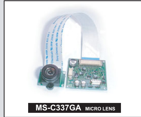
MS-C337GA MICRO LENS